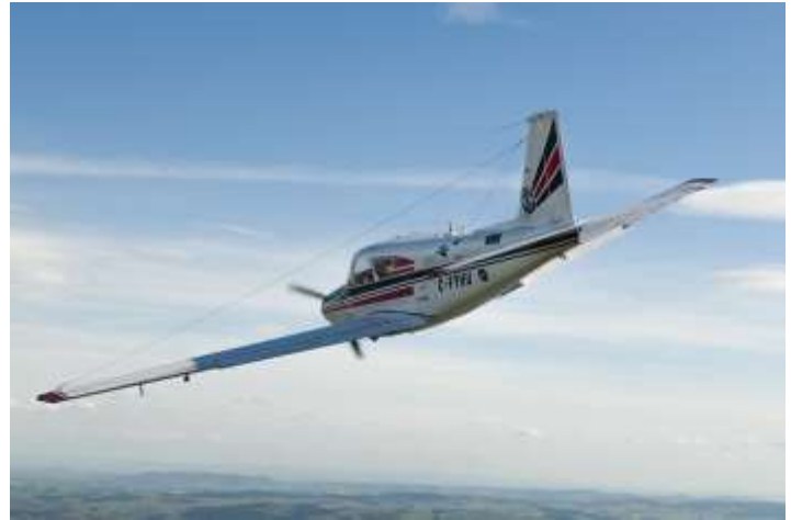
C-FYHU on approach

Following the Convention they made it back to Toronto exactly 80 days after starting FlyRTW80. The press was there to meet them, along with many from Sick Kids Hospital, their North American Charity. After a week and another 100-hour inspection Dave flew over the North Atlantic to Scotland finishing the other RTW for Scottish Air Ambulance in 80 days also.